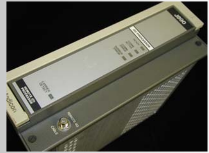
AS-J890-101 With F connector

The J890 remote I/O interface is a device which converts input/output information from the I/O cards located within the rack or backplane to the proper protocol for the coax media. This device handles many important functions. In this discussion, we will address the impact the device has or may have upon the media