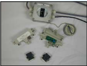
Common Connector Styles

While Modbus Plus is a robust network of peer to peer communications used on process control and data acquisition applications, several basic mistakes are commonly uncovered during the certification process performed by Delta Automation, Inc.'s Field Service Engineers. One, if not the, most frequent, is exceeding the maximum allowable limit of 1500 cable feet without a repeater. Modbus Plus is a continuous cable with four conductors, a twisted pair, a drain wire and a shield. You must use the approved shielded Belden cable for the network to perform properly.