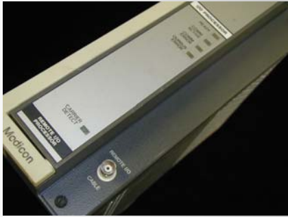
AS-J890-001 With BNC connector

The J890 remote I/O interface is a device which converts input/output information from the I/O cards located within the rack or backplane to the proper protocol for the coax media. This device handles many important functions. In this discussion, we will address the impact the device has or may have upon the media